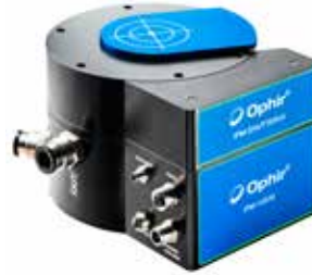
IPM-10KW with IPM-Shutter10