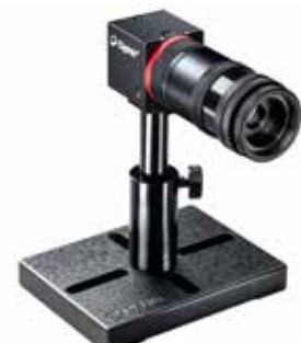
4X Beam Expander with UV Converter (SPZ17022+SPZ17019)